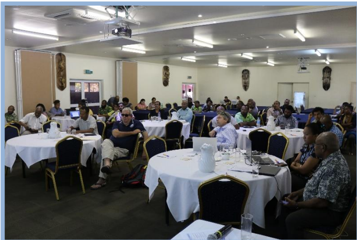
REDD+ Capacity Building and Consultation Workshop